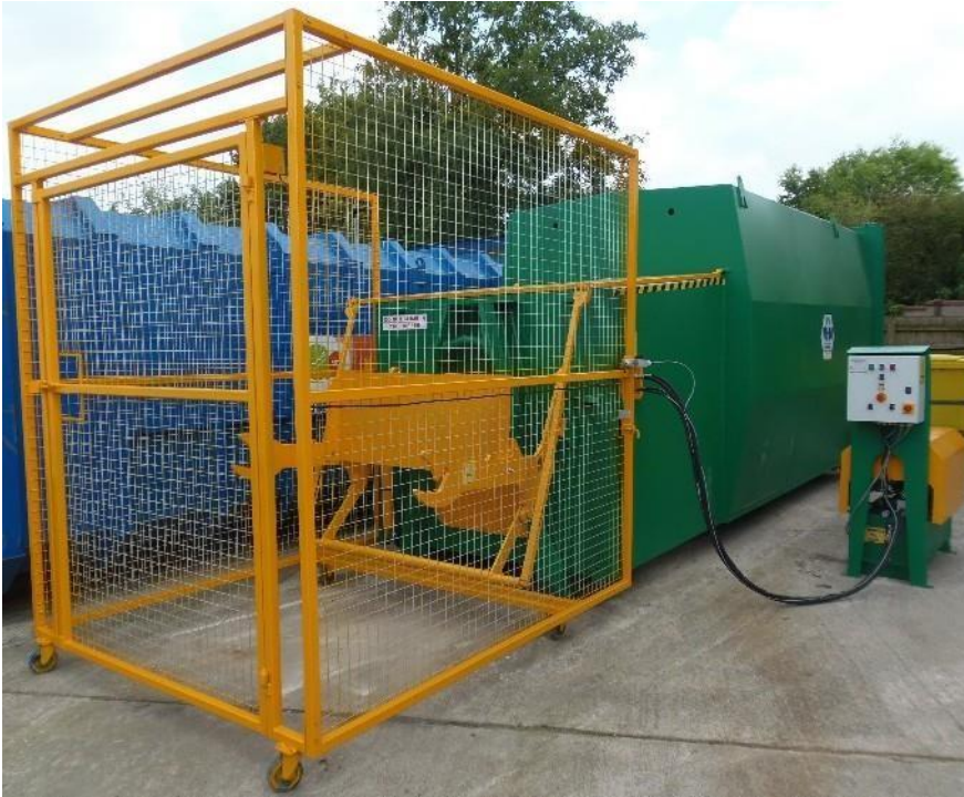
Pictured left: The 32yd portable compactor with stand alone powerpack and control panel. Installed on-site.