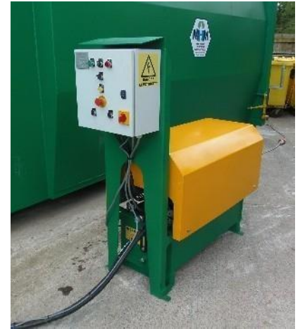
Pictured Above: The stand-alone powerpack and control panel.