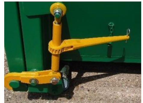
Pictured Above: The Door Lock Mechanism