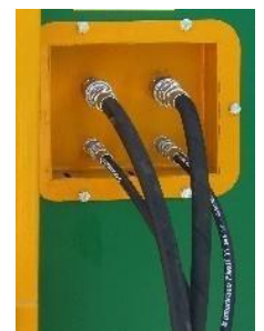
Pictured Right: Powerpack connection

All portable compactor machines sold are installed by our service department and full operator training is given on installation. Our recycling machinery is compliant and CE marked and carries a 12 months parts and labour warranty.