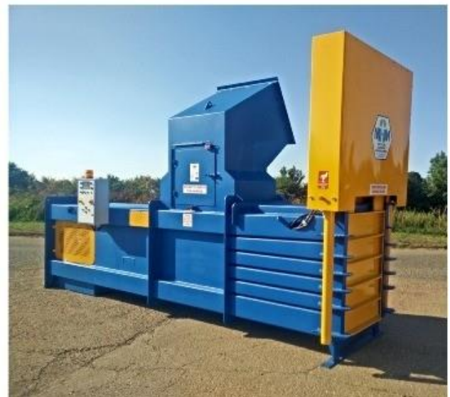
Photographs for illustration purposes only

Dimensions: Loading Aperture Nominal: 1250mm length x 800mm wide Loading Height: 1650mm Overall Baler Length: 5130mm Overall Baler Width: 1360mm (without Bin Lift) Overall Height: 2570mm